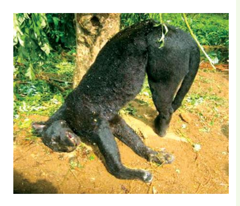
(Rare Black Leopard in buffer zone of Sinharaja Rainforest killed by a poacher's snare – Nov 2013)

Many buffer-zone rainforest lands are still privately owned. Increasingly these lands are being sold and forests cut down for monoculture plantations.